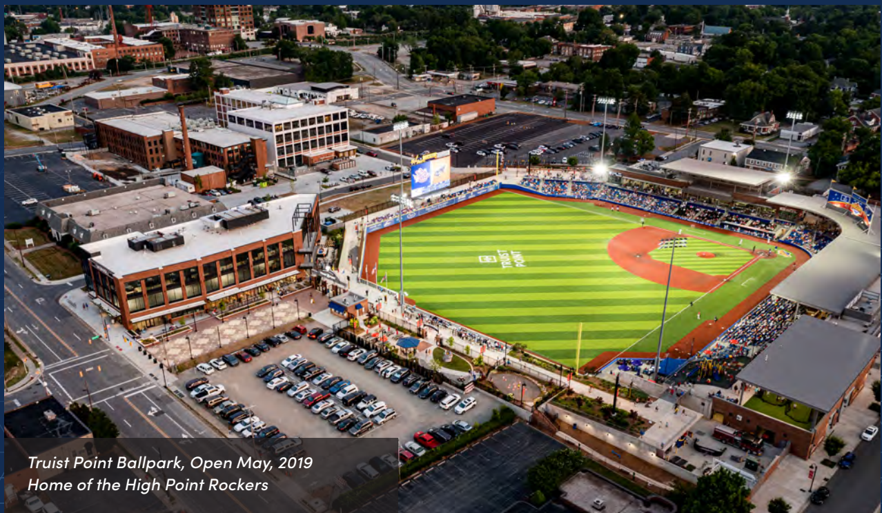
Truist Point Ballpark, Open May, 2019 Home of the High Point Rockers