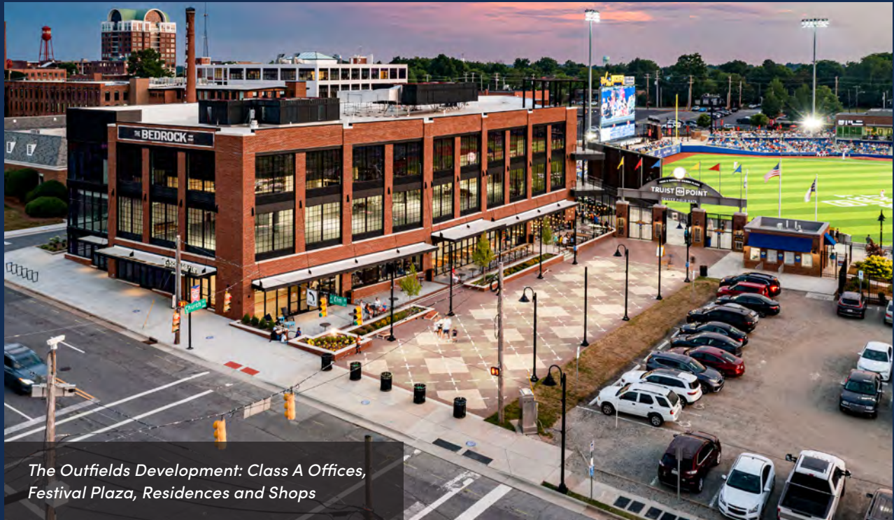
The Outfields Development: Class A Offices, Festival Plaza, Residences and Shops

A catalyst development project is happening at the center of High Point, NC, featuring residences, Class A offices, shops, and a grand plaza just beyond the outfields of the new Truist Point baseball stadium, which opened in May of 2019. The Outfields development will be donned with the art and history of the local furniture heritage, and will be a place of community – attracting people to work, live, and play in the city.