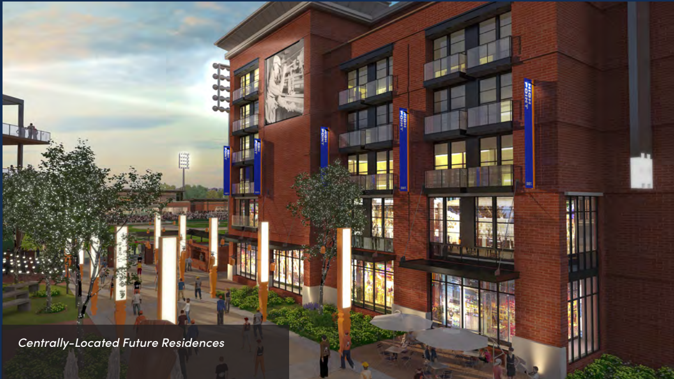
Centrally-Located Future Residences

The Outfields master plan includes the addition of beautifully-designed and amenity-rich residences centered around Truist Point Stadium in downtown High Point. The revitalized location invites families, local businesses and market-goers to a new, year-round community-focused environment that includes The Bedrock as a vital part of the project.